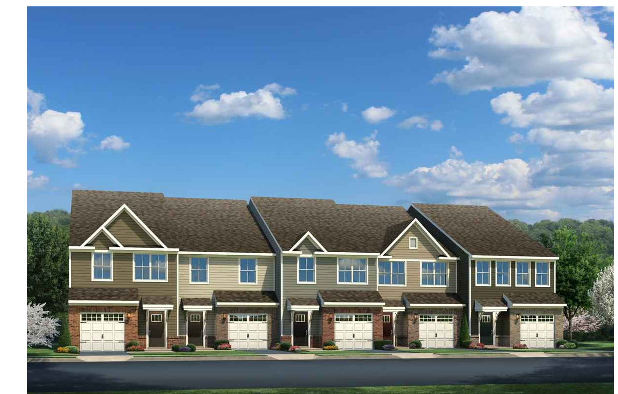
TYPICAL TOWNHOUSE BUILDING ELEVATION