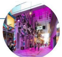
Retail Passage / Covered Parking